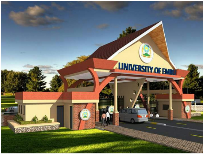
The Artist Impression of the upcoming University of Embu Main Gate